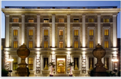
Grand Hotel Palazzo Carpegna