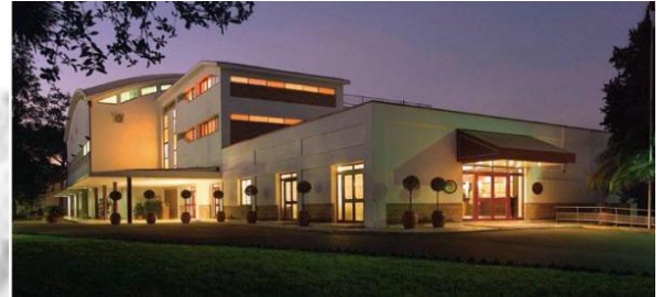
Torre Rossa Park Hotel

The 3 rd IASSID-Europe Conference will be held during 20 th -22 nd October, 2010 in the Grand Hotel Palazzo Carpegna and the neighbouring Torre Rossa Park Hotel, in Rome, Italy. The official language is English with simultaneous translation in Italian for the plenary presentations.